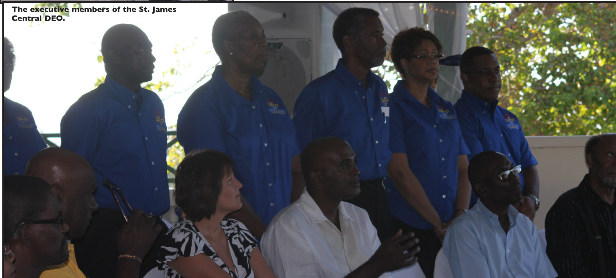
The executive members of the St. James Central DEO.

He told the members of the DEO that their safety of the elderly and disabled programme and their hydrant checks were efforts that aided the service's fire prevention and mitigation. "You have certainly been bold and visionary in pursuit of minimising both human and economic lost in the event that a disaster strikes in your area. You have researched and refined your response mechanisms and you are also constantly building capacity. "This model which you are developing can be easily transferred across the other DEO's and can serve as a catalyst in rejuvenating some of the less vibrant ones. Your main challenge going forward will be to forge linkages with corporate entities and other service providers to ensure that all of your programs are sustained and remain meaningful over the longer term," he said. (LB)