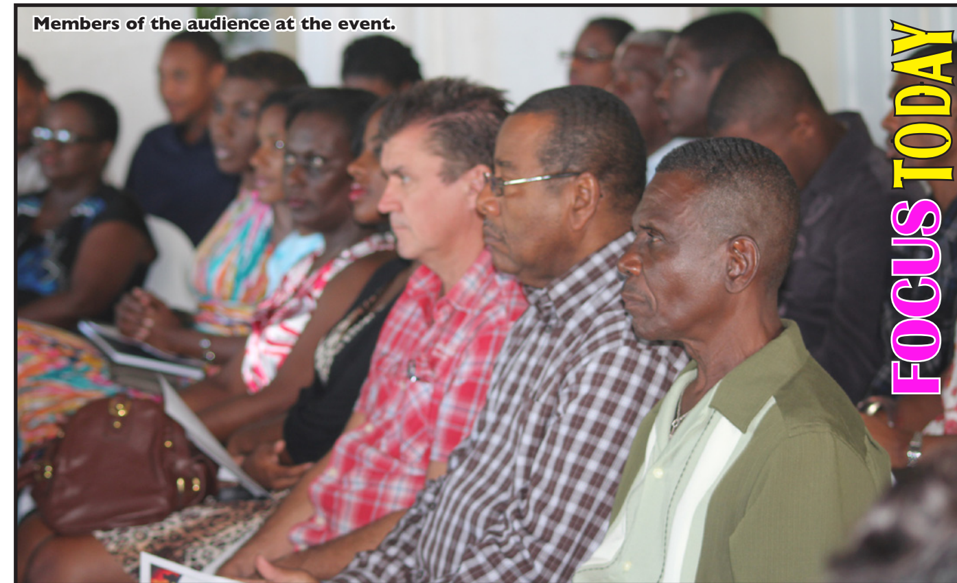
Members of the audience at the event.